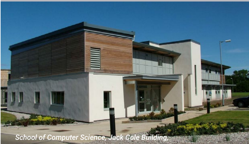
School of Computer Science, Jack Cole Building.